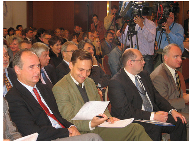
Conference 'Polish Foreign Policy at Crossroads' Paweł Zalewski, Radek Sikorski